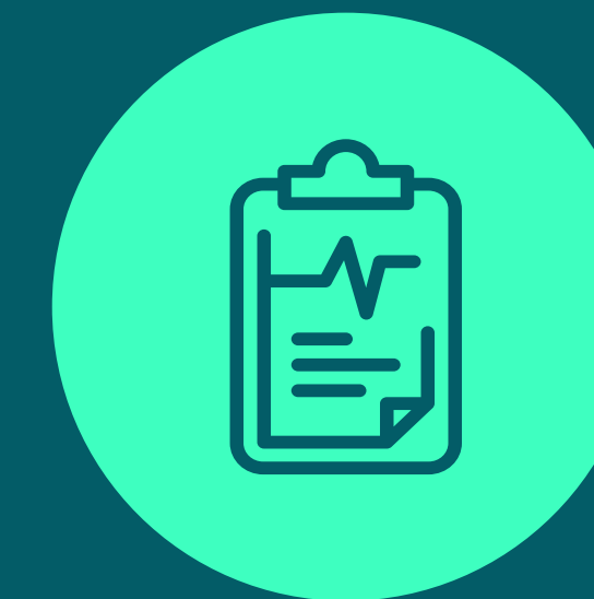
Utilization Management Programs